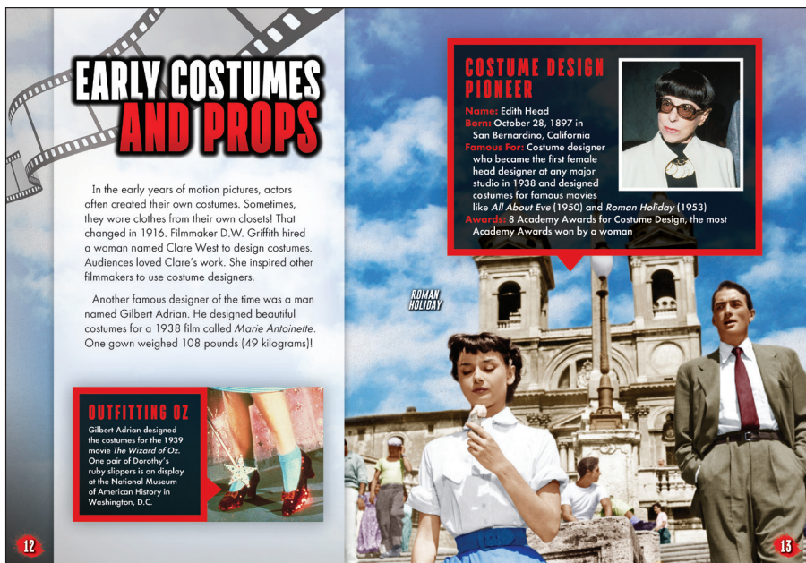
Sample spread from Costumes and Props